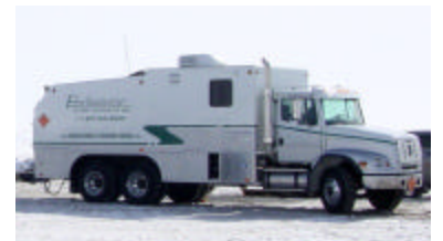
Endeavor Wireline Truck

33,000 psi was the peak gas pressure recently recorded with a Kipster gage during a GasGun stimulation.